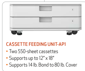
CASSETTE FEEDING UNIT-API