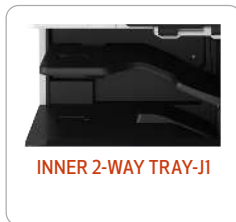
INNER 2-WAY TRAY-J1