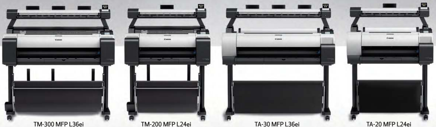
TM-300 MFP L36ei

Free Layout Plus: Nest, tile, and create custom layouts before printing your files with this print utility. Use the Plug-in feature to print directly from Microsoft office programs.